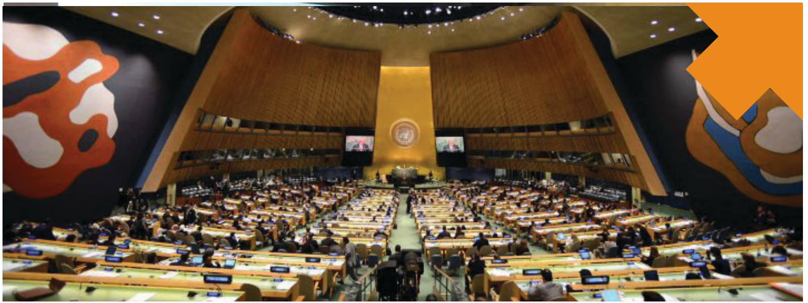
South African President Jacob Zuma addresses the 71st Session of the United Nations General Assembly. (Photo credit: GCIS & GovernmentZA via Flickr / Creative Commons) http://bit.ly/2e46pWW