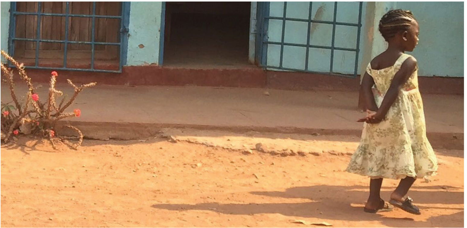
A photo captured by a RefugePoint Resettlement Expert depicts a child in a refugee camp in Zambia.