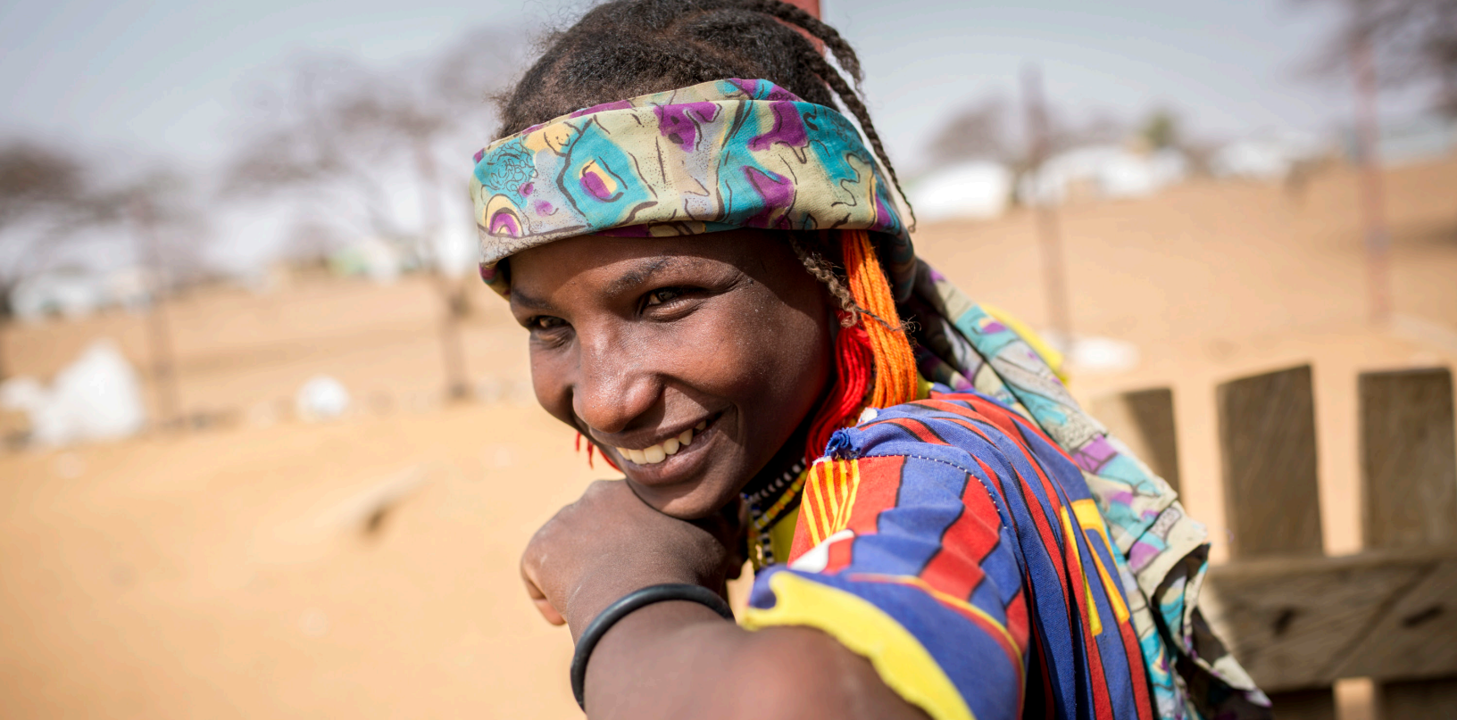
Waiting for her resettlement interview at Goudoubo Refugee Camp.